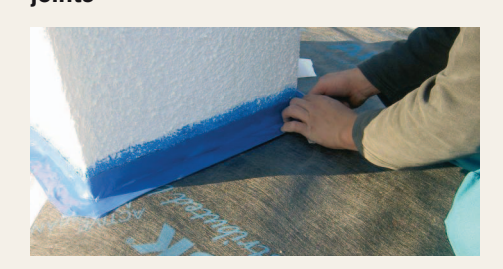
Roll dimensions Length: 25 m / Width: 80 mm / Thickness: 2 mm

Box contents Pallet details 2 rolls = 50 m¹ 40 boxes = 2'000 m¹