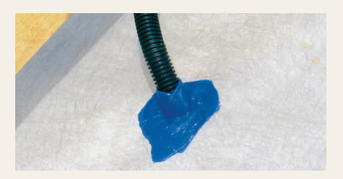
Roll dimensions Length: 5 m / Width: 50 mm / Thickness: 2 mm

Box contents Pallet details 12 \text{ rolls} = 60 \text{ m}^1 40 \text{ boxes} = 2'400 \text{ m}^1