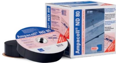
Ampacoll® ND 80: Nail seals, 80 mm wide