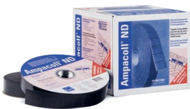
Ampacoll® ND 60: Nail seals, 60 mm wide