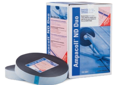
Ampacoll® ND duo Nail sealing tape adhesive on both sides