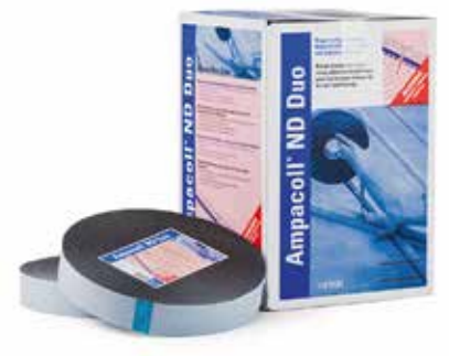
Ampacoll® ND Duo: Nail sealing tape adhesive on both sides