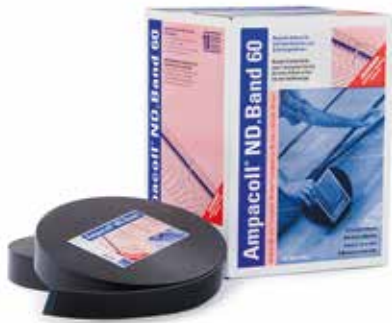
Ampacoll® ND.Band 60 Nail seals, 60 mm wide