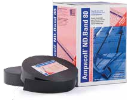
Ampacoll® ND.Band 80 Nail seals, 80 mm wide