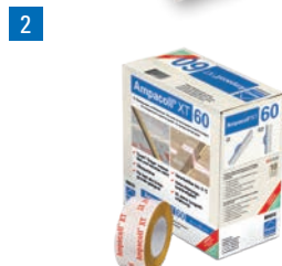
Ampacoll® XT 60: Acrylic adhesive tape