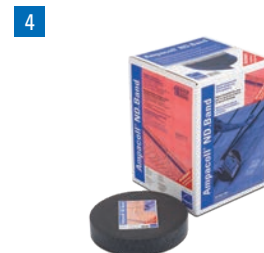
Ampacoll® ND.Band: Nail sealing tape