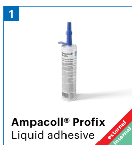
Ampacoll® Profix Liquid adhesive