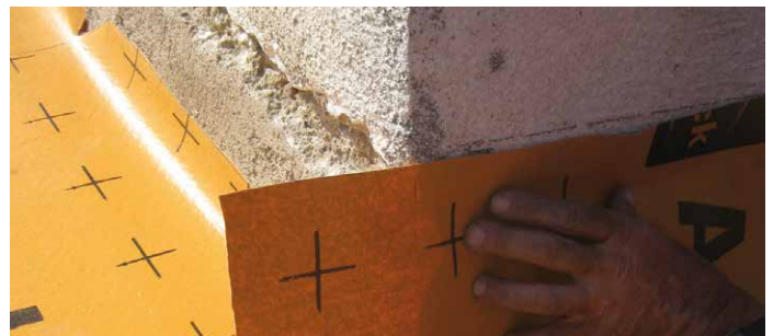
5 Wastage-free formation of connections