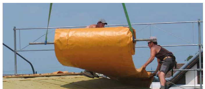
7 Prefabrication of jumbo rolls and above