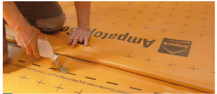
3 Welding with Ampacoll® LiquiSeal