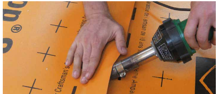
4 Welding with hot air