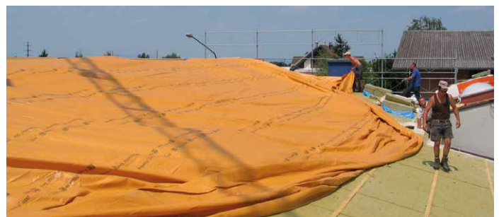
6 Easy to roll out